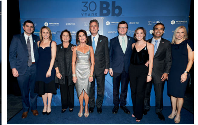
Bush family members at the 30th Anniversary Celebration