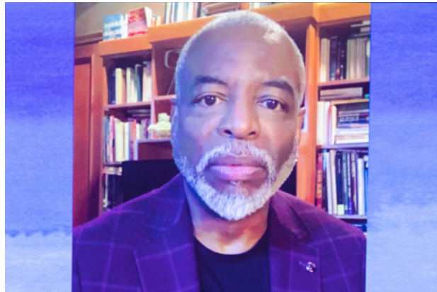
LeVar Burton accepting his Barbara Bush National Literacy Honors Award