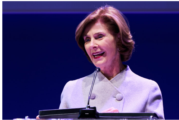
Former First Lady Laura Bush opens the 30th Anniversary Celebration

The National Celebration of Reading brings together members of the Bush family, bestselling authors and entertainers, and special guests to advance the work of the Barbara Bush Foundation for Family Literacy. This very special event at the John F. Kennedy Center for the Performing Arts raises support for nationwide literacy programs and increases awareness of our country's literacy crisis.