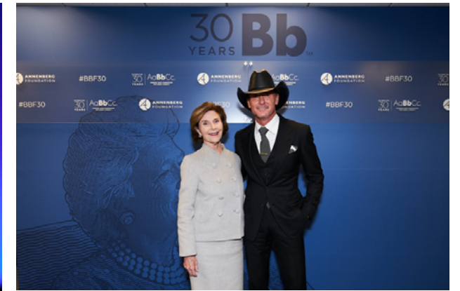
Former First Lady Laura Bush and Grammy award winner Tim McGraw