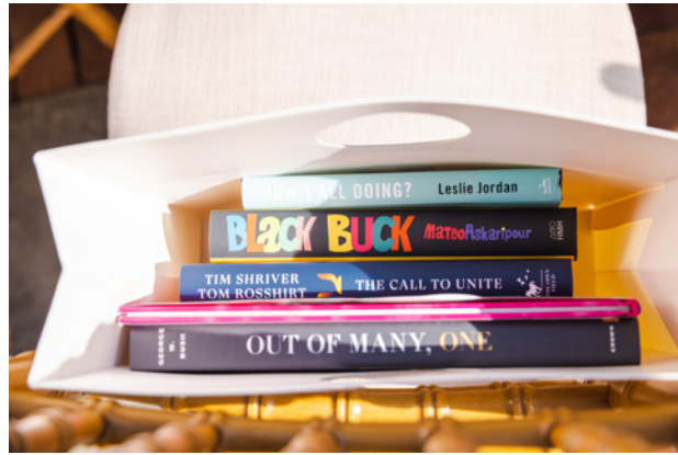
Autographed books for our distinguished guests and sponsors at the VIP Authors' Luncheon