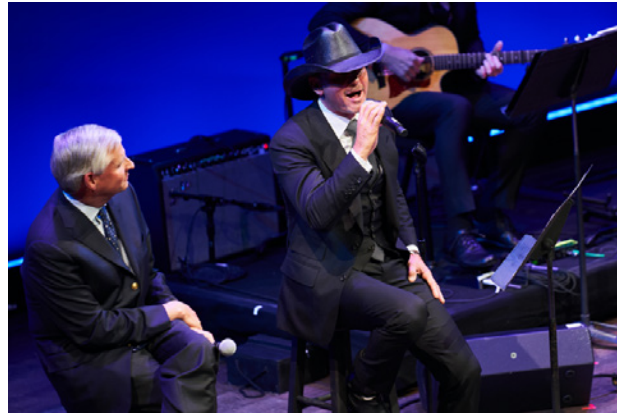
Pulitzer Prize-winning author Jon Meacham and Grammy award winner Tim McGraw