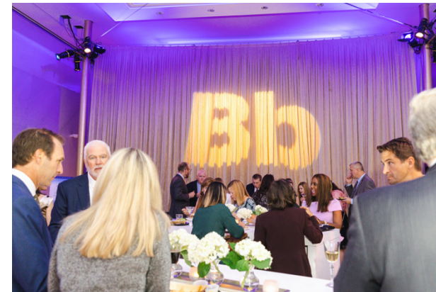
Distinguished guests and sponsors enjoying the 2021 post-reception